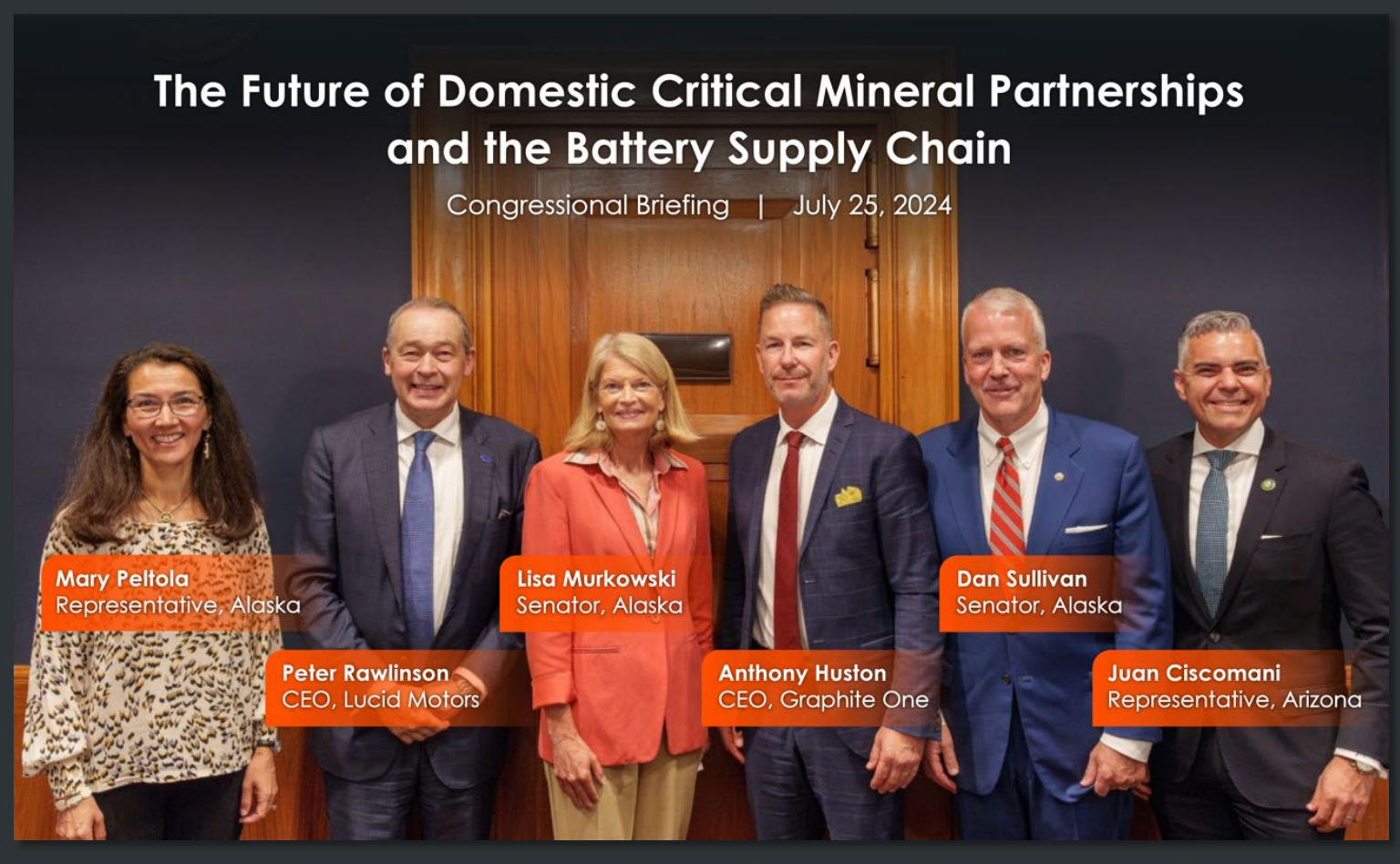
Non-binding agreement for 5,000 tpa of AG AAM for initial term of 5 years